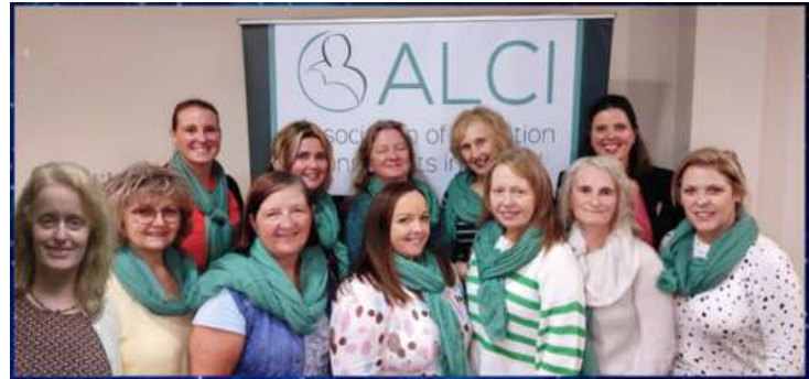
ALCI Council 2022